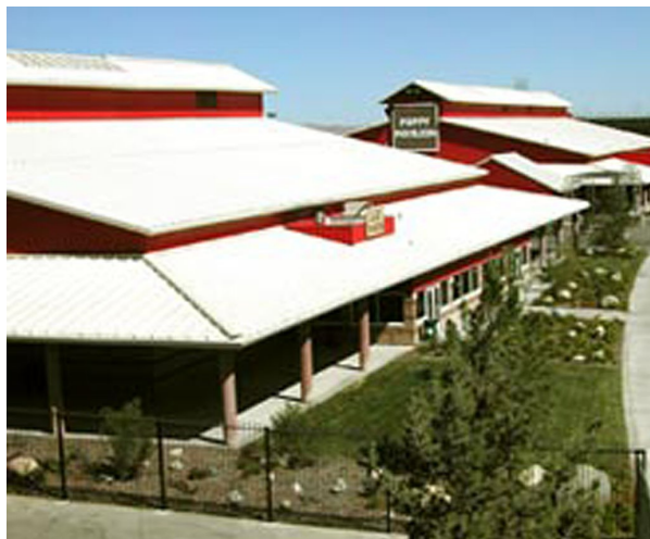
AV Fairgrounds Poppy Pavilion

Sunday, October 14, 2012. The AV Fairgrounds will host the 85th Annual Old Timers Barbecue. This is a separately sponsored event and a separate fee is required to attend.