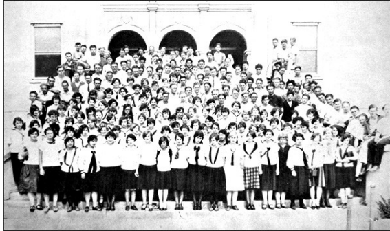
Students of 1926

In 1912, the people of Lancaster and the Antelope Valley looked to the future as they approved the creation of a new high school for their children. As the 20th Century progressed, the school grew and evolved. It hosted the early Antelope Valley College in 1929. During the 1950s a new campus was built giving us the campus we know today.